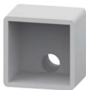
End cap with hole