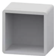
End cap no hole