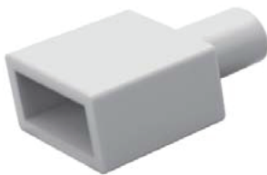
End cap with hole