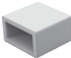
End cap no hole